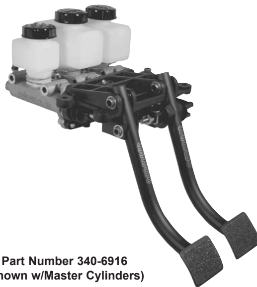
Part Number 340-6916 (Shown w/Master Cylinders)

Wilwood's forward mount dual steel pedal assembly must be mounted using the four outboard tab mounting holes. Attach the pedal assembly to two sturdy beams or plates with four 5/16 inch bolts. Pedal assembly must be rigidly attached to frame and not deflect under heavy pedal forces. Pedals must be free from obstructions over their entire range of motion. Allow enough space so balance bar adjustments can be made and masters cylinders are accessible.