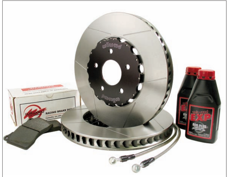
Mitsubishi EVO VIII Pro-Matrix Upgrade Kit with GT Rotor