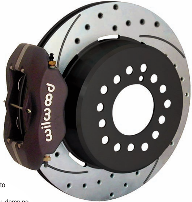
Mustang Pro Series Rear Kit with SRP Rotor

Please check the diagram on the back of this page for minimum inside wheel clearance requirements