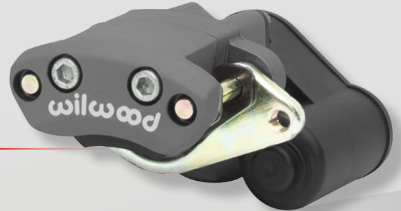
Left-Hand Motor, 4.75" Center Mount Type-III Hard Ano Finish