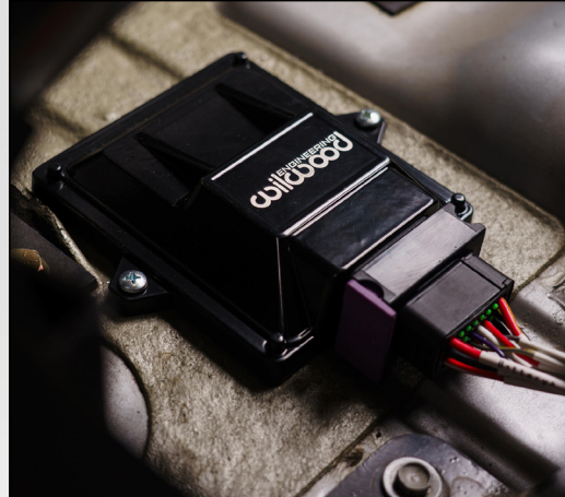
EPB Control Module

Red when engaged and ignition is on (No draw when ignition is off)