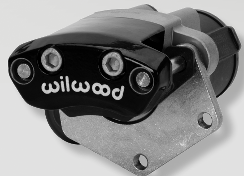
Right-Hand Motor, 2.00" Offset Mount Gloss Black Powder Coat Finish