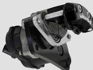
EPB, Left-Hand Motor Shown with mounting bracket available separately for select Wilwood calipers, and included in complete rear brake kits with EPBs