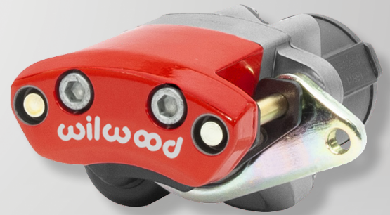
Right-Hand Motor, 4.75" Center Mount Gloss Red Powder Coat Finish