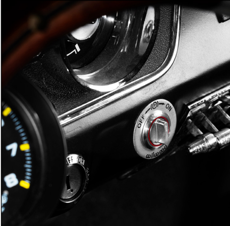
EPB On-Off Switch

Red when engaged and ignition is on (No draw when ignition is off)