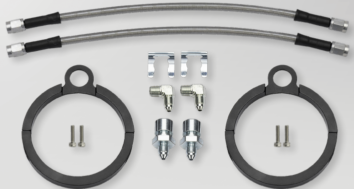
3.00" Axle Clamp Flexline Kit P/N 220-17289

Includes 3.00" axle clamp-on brackets with line mounts to hold the 12" Flexline-to-caliper connection to a 3/16" chassis hardline. Choose either 45° or 90°, -3 to 1/8-27 NPT fittings at the caliper end, and mount the -3 to 3/8-24 IF through the mount on the axle clamp and hold in place using the provided chassis retainer clips.