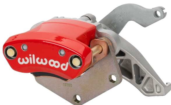
Right-Hand Pull, 2.00" Offset Mount Holes Gloss Red Powder Coat Finish

P/N 120-15353-RD (high-res photo, click here )