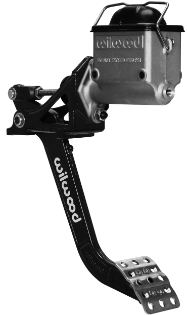
Pedal Shown with Optional Master Cylinder