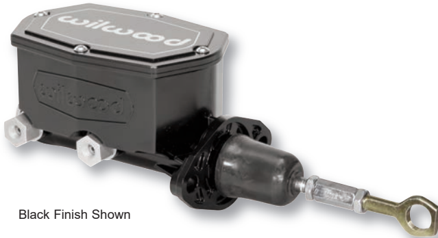
Black Finish Shown

260-15520-P/-BK • 260-15521-P/-BK 260-15542-P/-BK • 260-15543-P/-BK