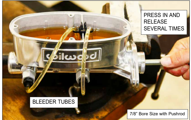
Typical Bleeder Tube Setup and Use