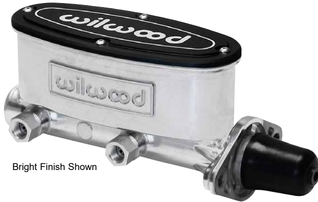
Bright Finish Shown

260-8555/-P/-BK • 260-8556/-P/-BK 260-9439/-P/-BK • 260-13375/-P/-BK