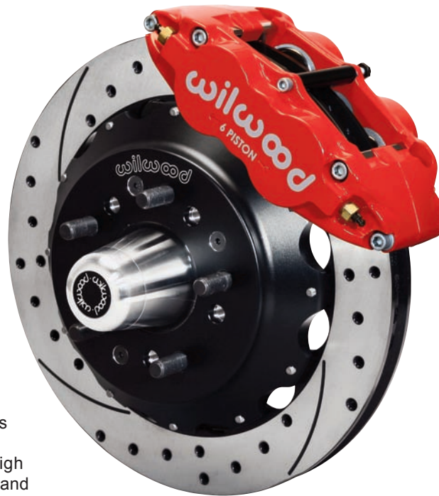
Big Brake Front Kit with SRP Rotor and Red Caliper Download High Resolution Photo, click here