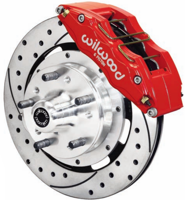
Front Kit with SRP Rotor and Red Caliper

Download high resolution photo, click here