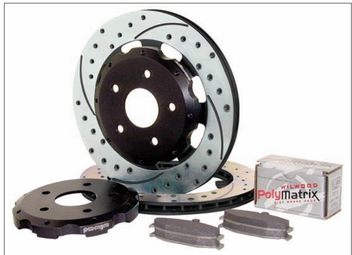
Pro-Matrix C-4 OE Rear Upgrade Pad and Rotor Kit with SRP Rotor