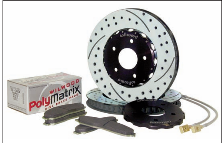
Pro-Matrix OE Front Upgrade Pad and Rotor Kit with SRP Rotor