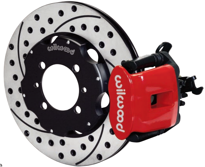
Combination Caliper Rear Parking Brake Kit with SRP Rotor Down Load High Resolution Photo, click here