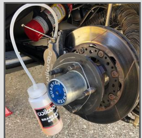
Wilwood Bleed Bottle: P/N 260-16018

For technical questions, please reach out to a Wilwood Race Specialist serving your class or category. WilwoodRacing.com