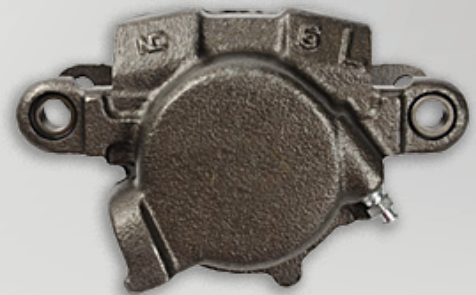
GM's Asymmetrical Metric Iron Caliper