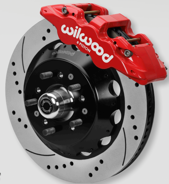
Aerolite 14.00" Kit P/N: 140-17149-DR