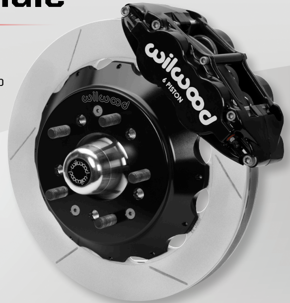
Superlite 12.88" Kit P/N: 140-17088