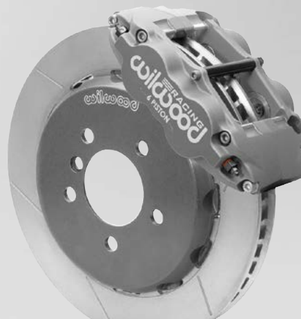
SUPERLITE 13.06" FRONT KIT P/N 140-16005 FNSSL6R/ST