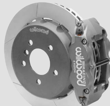
SUPERLITE 13.00" REAR KIT P/N 140-16017 FNSSL4R/ST