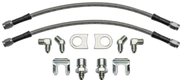
Weld-On Tab Flexline Kit P/N 220-17288 (download hi-res photo )