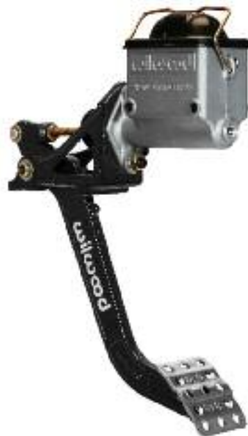
Pedal Shown with Optional Master Cylinder