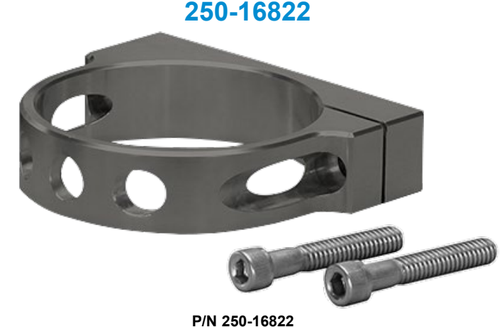
Anodized aluminum single mount bracket with screws for remote mount 4 ounce fluid reservoir

Billet finish aluminum single mount bracket with screws for remote mount 4 ounce fluid reservoir