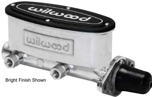
Bright Finish Shown

260-8555/-P/-BK • 260-8556/-P/-BK 260-9439/-P/-BK • 260-13375/-P/-BK