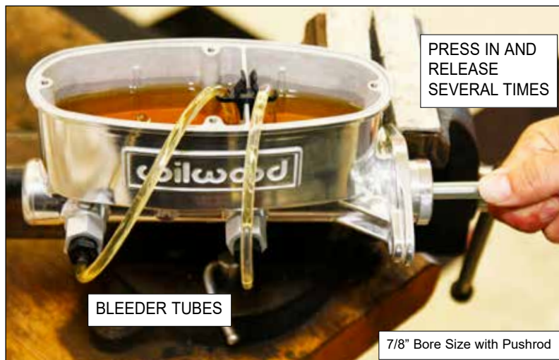
Typical Bleeder Tube Setup and Use