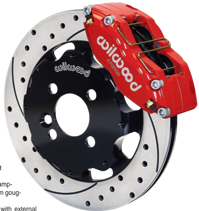
BMW Mini Cooper Big Brake Front Kit Down Load High Resolution Photo, click here

Please check the diagram on the back of this page for minimum inside wheel clearance requirements