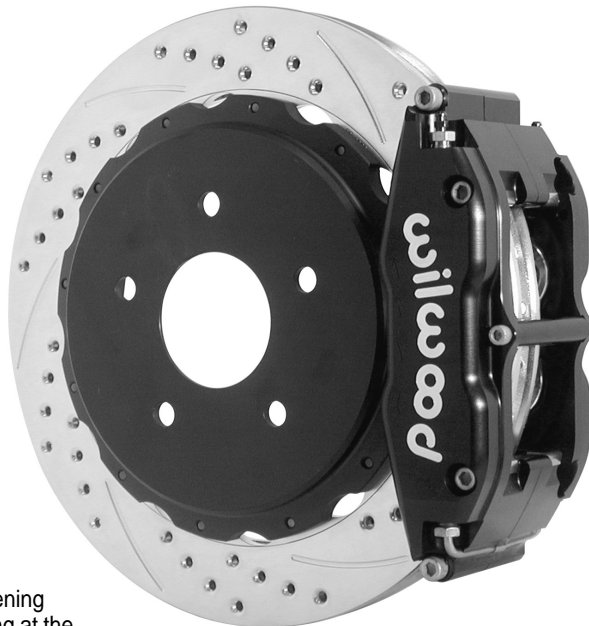
Corvette C-5 / C-6 Big Brake Rear Kit with SRP Rotor