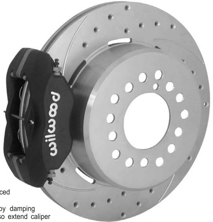
Rear Parking Brake Kit with SRP Rotor

Please check the diagram on the back of this page for minimum inside wheel clearance requirements