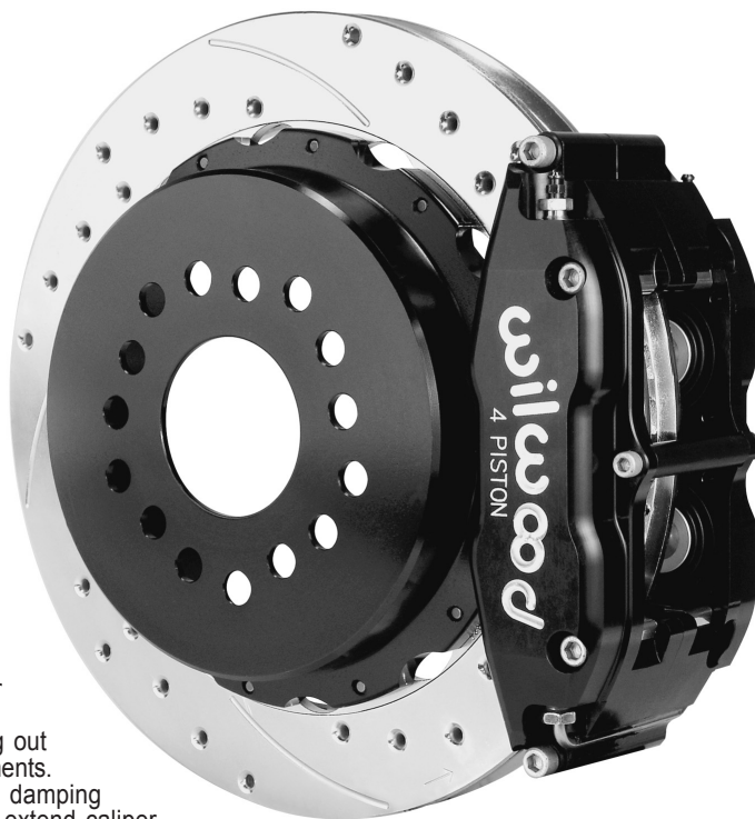
Rear Parking Brake Kit with SRP Rotor