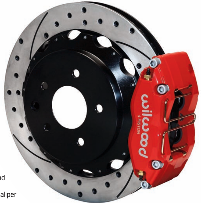
Nissan/Infiniti Big Brake Rear Kit with SRP Rotor