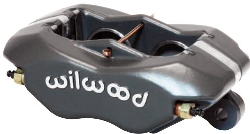
Example of Platinum-E Coating