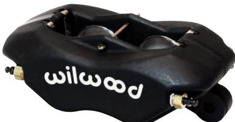
Example of Anodized Coating