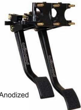
Example of Anodized Coating