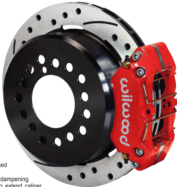
Rear Parking Brake Kit with Optional SRP Rotor and Red Caliper

Please check the diagram on the back of this page for minimum inside wheel clearance requirements