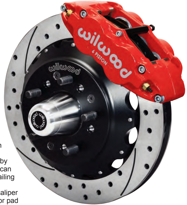
G Body Big Brake Front Kit with SRP Rotor and Red Caliper