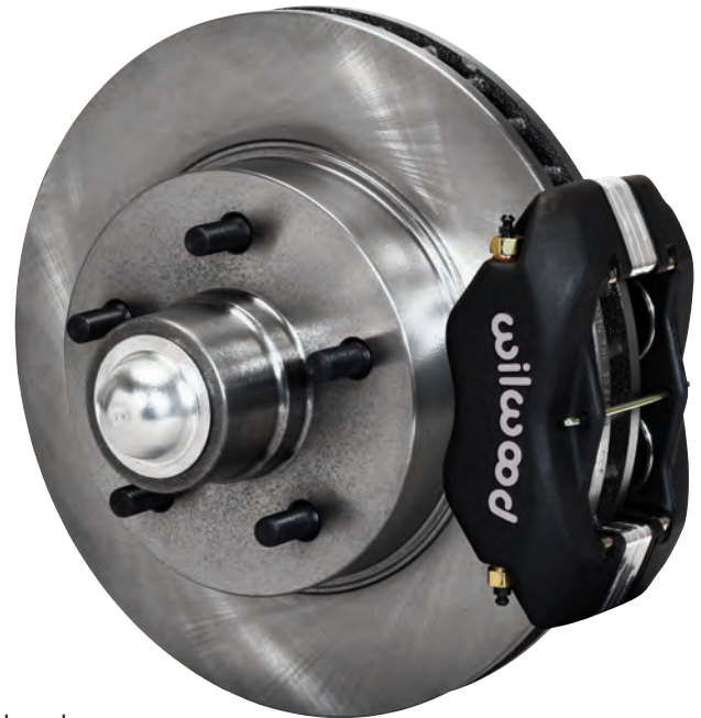
Front Kit Assembly