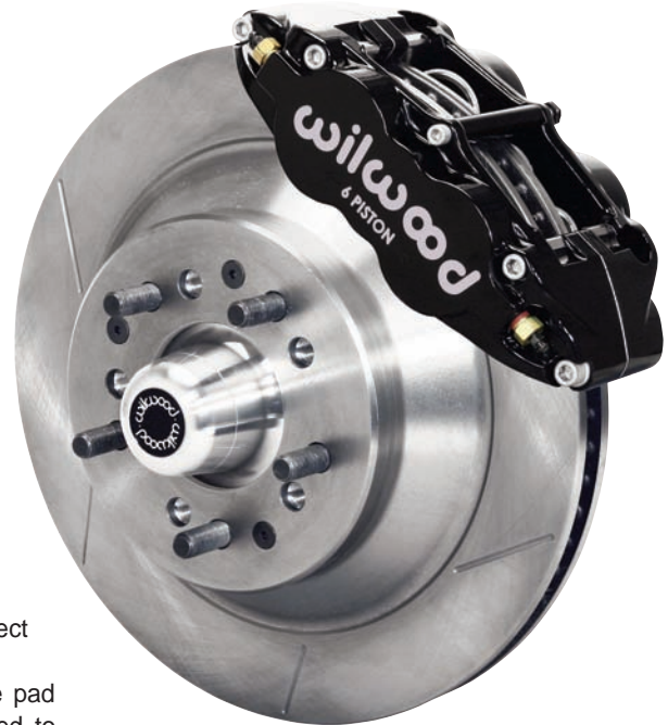
Big Brake Front Kit Assembly with GT Rotor, $1,343.99 as Shown Download High Res Photo, Click Here