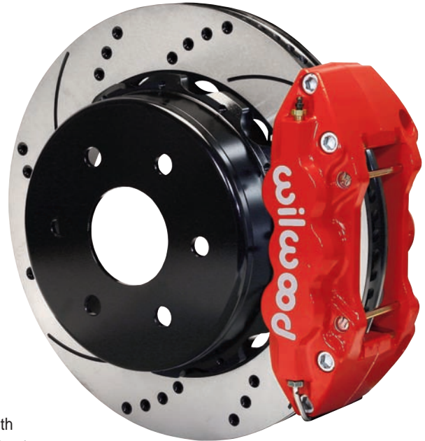
Big Brake Rear Kit with SRP Rotor and Red Caliper

Download High Resolution Photo, Click Here