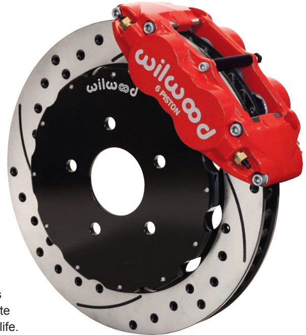
Corvette C-3 Big Brake Front Kit with SRP Rotor

Optional stainless steel flex ines with machine crimped ends, include the fittings necessary to connect the calipers with the OE brake line fittings at the chassis. Flex lines kits must be ordered separately.