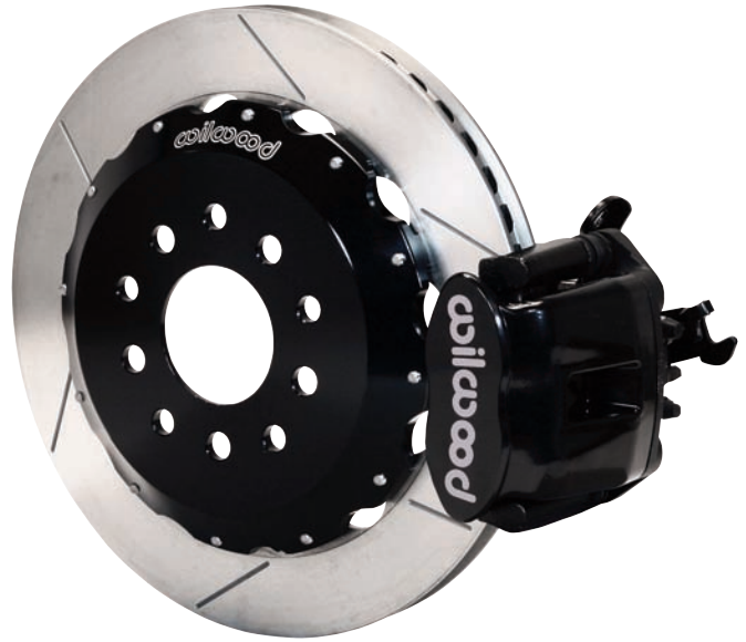
Honda S2000 Big Brake Rear Kit with GT Rotors

Single piston floating mount calipers are securely attached to the axle with a fixed radial mount bracket on the axle. The floating mount caliper maintains perfect alignment when the cable actuated mechanical parking brake lock is engaged and then released. Correct alignment is maintained over the disc as the pads wear and pad knock back is minimized. Radial mounting provides secure attachment to the axle housing end and precise adjustments for pad to rotor alignment. The cable actuated parking brake is easily adapted to the original cable system. Cables for aftermarket hand brake lever kits are easily configured for custom fabricated installations.