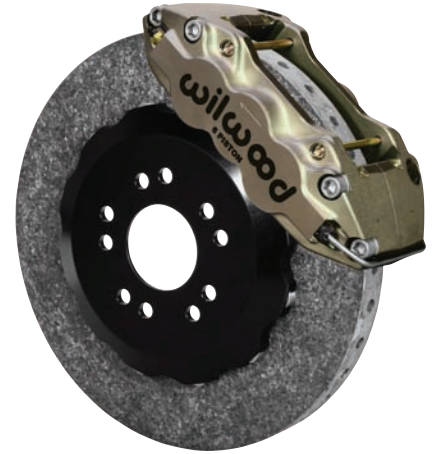
WCCB Big Brake Front Kit For high resolution photo for printing, click here