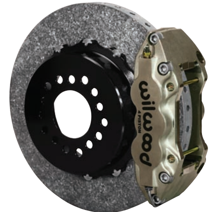
WCCB Big Brake Rear Kit For high resolution photo for printing, click here