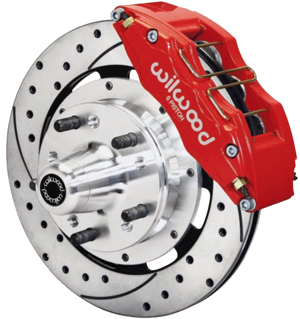
Front Kit with SRP Rotor and Red Caliper

Download high resolution photo, click here