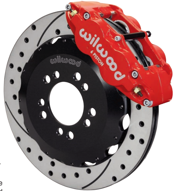
FNSSL6R Kit Assembly, 12.88" Shown

Download High Resolution Photo, Click Here