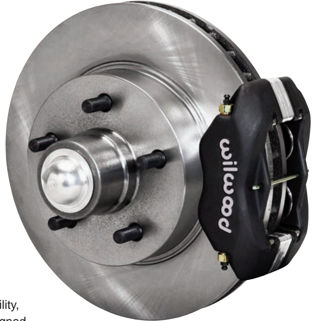
Front Dynalite Classic Series Kit To Download a high resolution photo, click here