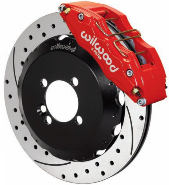
DynaPro 6 Kit Assembly To Download High Resolution Photo, Click Here