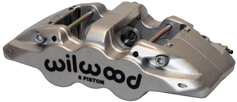
Aerolite 6R/ST Caliper Shown in Quick-Silver

The Aerolite forgings incorporate an integral center bridge with a total of five high strength steel cross bridge bolts that add structural rigidity with added resistance to body deflection and separation under high loads. The body accommodates 20mm type 6620 pads with 1.25" rotors for durability and long wear on long runs. The combination of premium grade billet, stress flow forging, and a highly efficient overall design, make the new Aerolite calipers as strong as any, including one piece calipers, of any caliper design in its category.