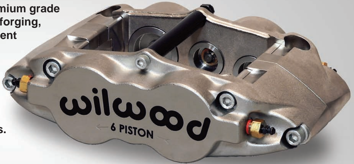
FSL6R/ST Quick-Silver with Thermlock® Pistons

Wilwood Superlite (FSLR) radial mount calipers combine state-of-the-art forged caliper technology, with track proven performance options for oval track, off-road, and road course competition. Premium grade billet, stress flow forging, and a highly efficient over all design, make the FSLR calipers as strong as any design in its class, including one-piece calipers.