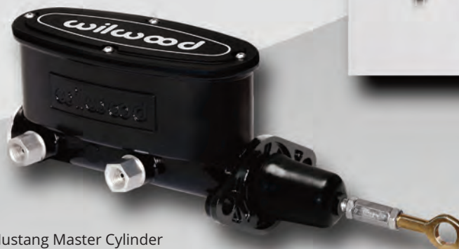
Mustang Master Cylinder Shown in Black E-coat Finish