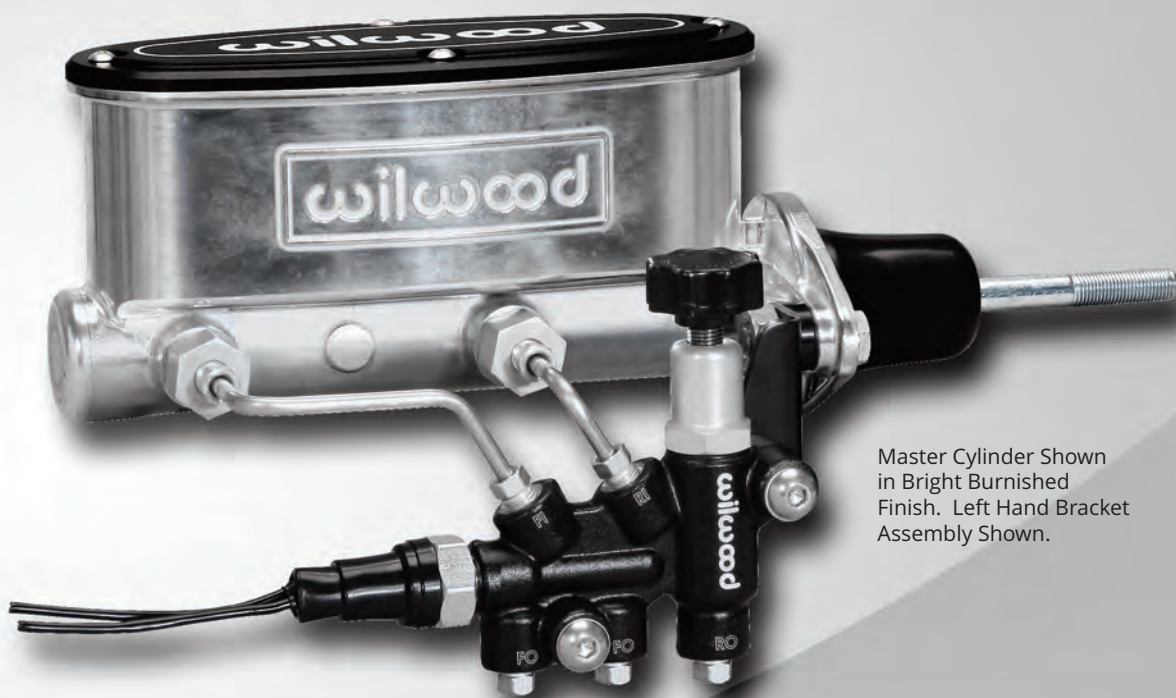
Master Cylinder Shown in Bright Burnished Finish. Left Hand Bracket Assembly Shown.

Wilwood Tandem Master Cylinders represent the latest refinements in brake pressure actuation and fluid control. Available in four bore sizes as a stand-alone unit or in a kit.