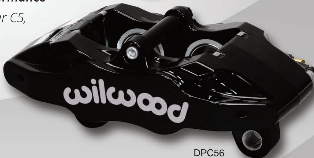
DPC56 Rear Caliper

and show styling of your C5, base model C6 and all other Corvette suspension-based hot rods with these forged aluminum four piston calipers.