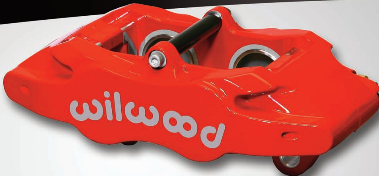
SLC56 Front Caliper