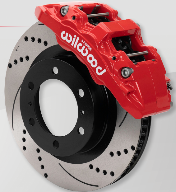
Aero6-DM Six Piston Brake Kit 13.31" SRP Drilled & Slotted Rotor