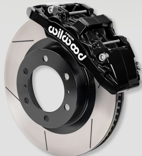
Aero6-DM Six Piston Brake Kit 13.31" GT Slotted Rotor