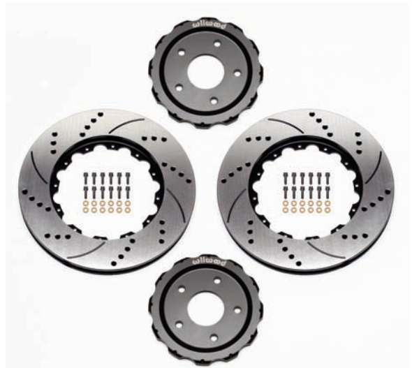
SRP Rotor Complete Kit

Download High Resolution Photo, Click Here