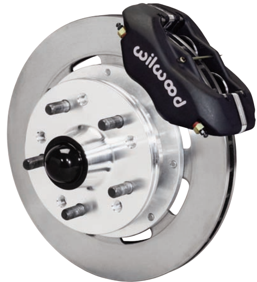
Front Dynalite Classic Series Kit Assembly