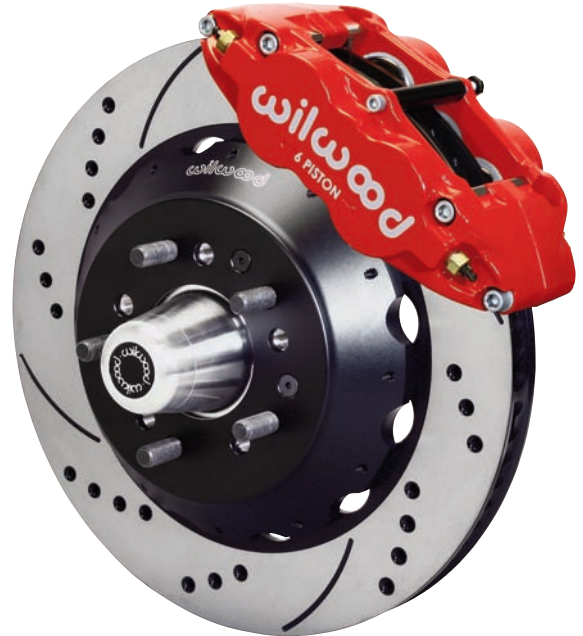
Front Mustang Big Brake Kit Assembly Download High Resolution Photo, Click Here