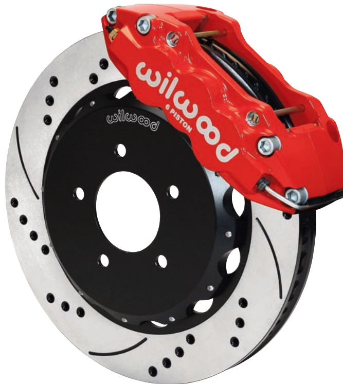
Front Big Brake Kit Assembly with Optional Red Caliper and Drilled Rotor

For more information or to obtain high resolution photos for printing, contact: Wilwood's Marketing Department at (805) 388-1188.