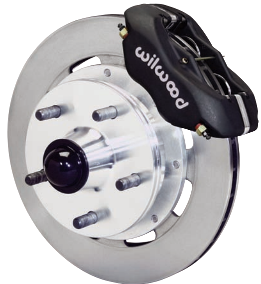
Front Dynalite Classic Series Kit Assembly