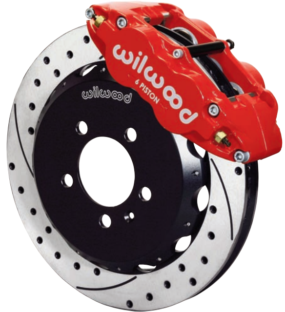
Volkswagen Brake Kit Assembly