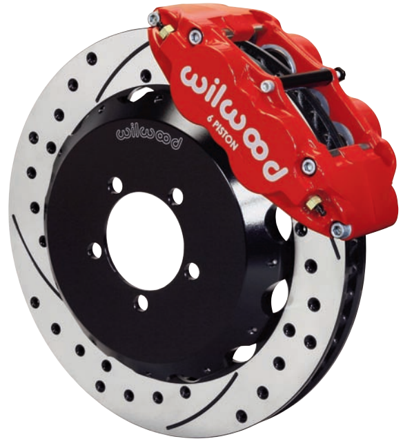
Subaru Brake Kit Assembly, 13.06" Kit Shown Download High Resolution Photo, Click Here